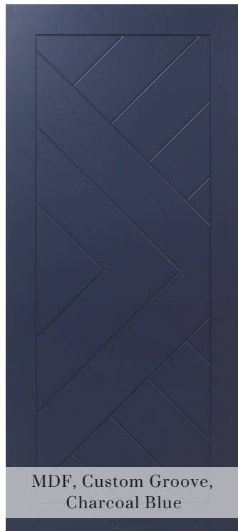
MDF, Custom Groove, Charcoal Blue