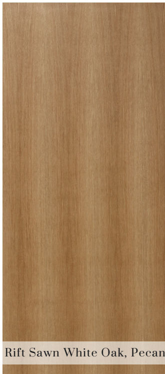
Rift Sawn White Oak, Pecan