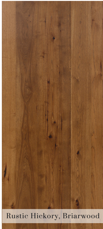
Rustic Hickory, Briarwood