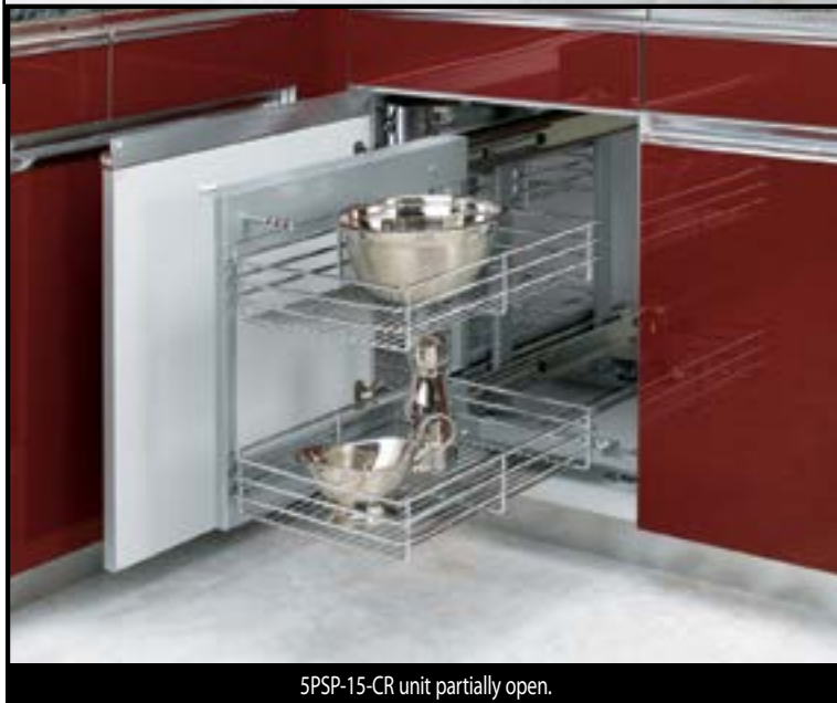
5PSP-15-CR unit partially open.