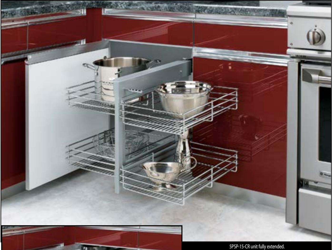
5PSP-15-CR unit fully extended.