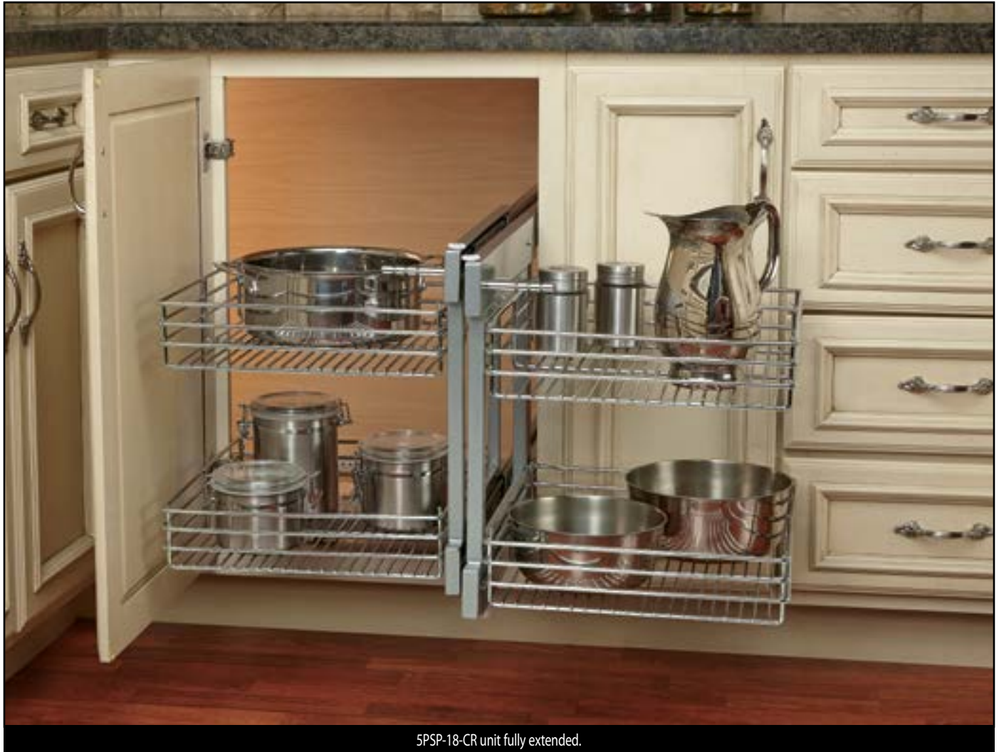
5PSP-18-CR unit fully extended.