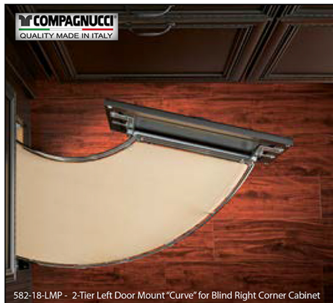
582-18-LMP - 2-Tier Left Door Mount "Curve" for Blind Right Corner Cabinet

Full Height* *we recommended mounting both tiers to door on full height door mount applications.