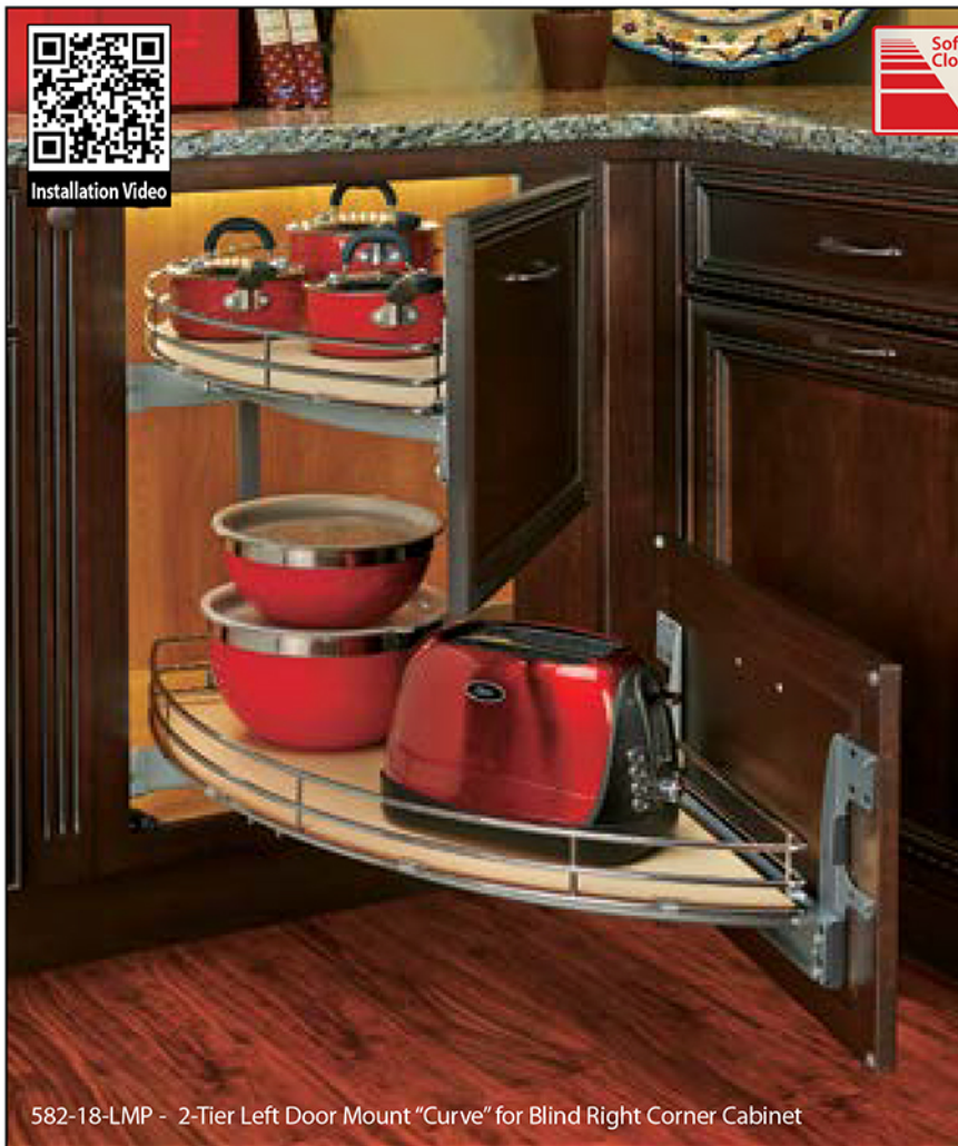
582-18-LMP - 2-Tier Left Door Mount "Curve" for Blind Right Corner Cabinet

"The Curve" takes luxury blind corner storage to the next level! The individual door mountable shelves provide a custom 2-Drawer look for your blind corner, and allow for complete access to your cabinet, utilizing an amazing 775 sq. inches of surface area. This product glides on our innovative roller coaster design and heavy-duty soft-closing slides (recommended not to exceed 60 lbs. per shelf). The shelves feature maple with Stylinox™, an Anti-Skid transparent coating that not only prevents skidding, but protects the wood from damage. Available for left and right hand blind corners, "the curve" has fully adjustable mounting brackets that allow it to work in full height, drawer/door, or custom 2-drawer applications.