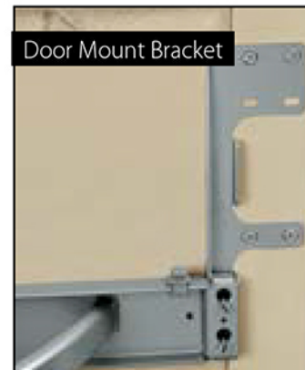
Door Mount Bracket