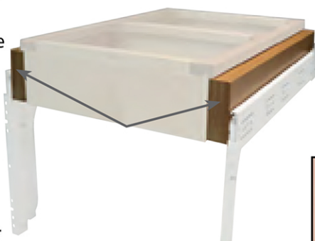
4WCTM SPACER KIT For Custom Installations. Adds up to 1½" (per side)

Made from solid wood (maple) construction, the Top Mount Pullout Waste Containers are available in a single 35 Qt. and 50 Qt., double 10 Qt., 27 Qt., 35 Qt., and 50 Qt. varieties. The 4WCTM Series is designed for absolute sturdiness with front side-mounting, rear adjustable mounting brackets for variances in cabinet depth, pre-assembled door mounting brackets and full-extension, ball-bearing, 150 lb. rated over-travel slides. In addition, the single 35 Qt. waste container system includes a short polymer bin that provides extra storage space for garbage bags.