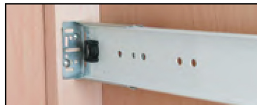
Rear mounting bracket is adjustable, for various cabinet depths.